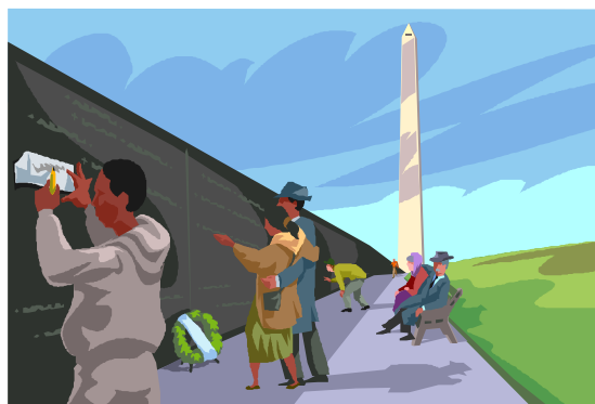
Veterans Day Holiday - November 11, 2008